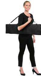
Carry Bag Included