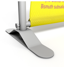
Adjustable Aluminium Telescopic Backdrop