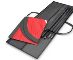
Includes Carry Bag