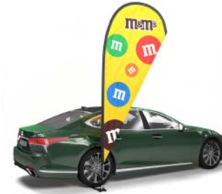
Custom Printed Fabric Graphics