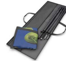
Includes Carry Bag