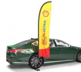
Custom Printed Fabric Graphics