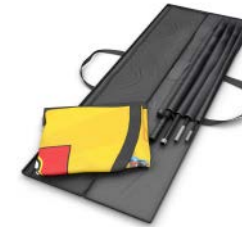
Includes Carry Bag