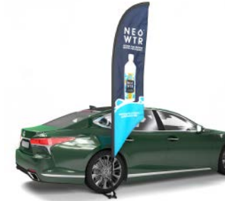
Custom Printed Fabric Graphics