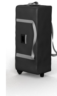
Carry Bag Included