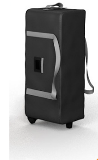
Carry Bag Included